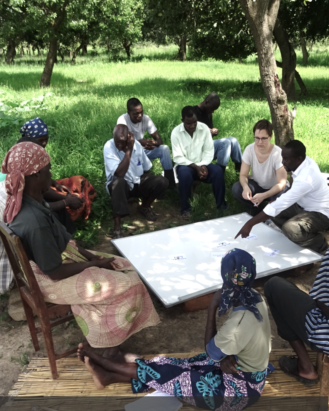
Facilitated systems modelling with small-scale farmers in Central Region, Zambia by researchers from the System Dynamics Group